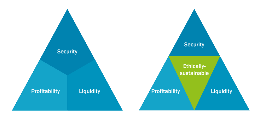
Fig. 1: In choosing a suitable investment, the individual objectives of security, profitability and liquidity* are balanced in the so-called "Magic Triangle of Investment" so that the investment-related overall economic goal is attained in the best possible way. By also considering non-economic objectives, the "Magic Triangle" becomes the "Ethically-Sustainable Investment Triangle."

Extending the "Magic Triangle of Financial Investment" to become the "Ethically-Sustainable Investment Triangle"